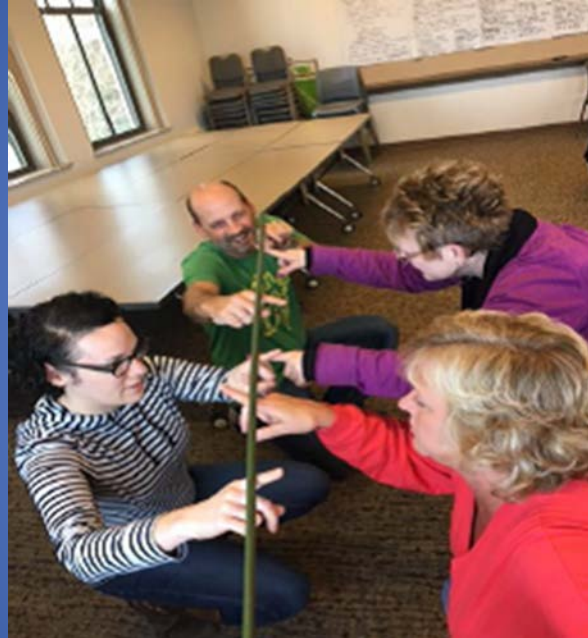
Workshop @ CCC March 18, 2016